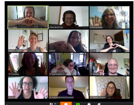
A VH Staff Meeting

We welcome back our current families, and also those who are thinking about homeschooling for the first time. We are committed to making the learning journey fun and personal, even online.